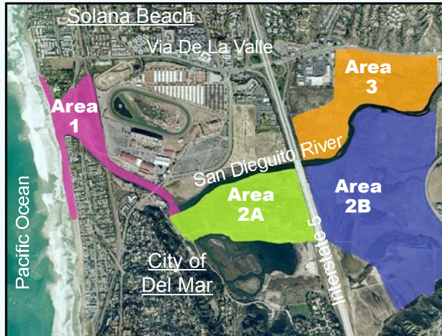
San Dieguito Wetlands Project Work Areas

VISIT THE NEW PROJECT WEBSITE: www.sdlagoon.com