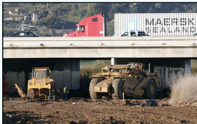
Creating haul road underneath I-5 freeway